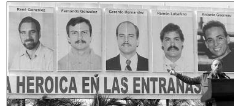
A bulletin board of the five Cubans in Havana, during a mass rally demanding their freedom.

The International Action Center is initiating the "Free the Five! National Committee to Free the U.S.-Held Cuban Political Prisoners, to demand their freedom.